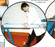
Holscot Range Of Seamless Heat Shrinkable Sleeves in FEP or PFA 25mm - 380mm

A lifting pole is required to support the roller while the sleeve is slipped over.